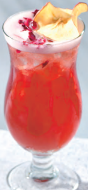
◀ 玫瑰蘋果冰茶 Rose Apple Iced Tea