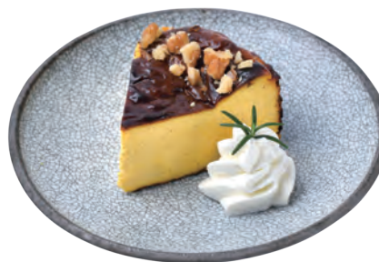
▲ 巴斯克南瓜肉桂乳酪 Basque Burnt Pumpkin Cinnamon Cheesecake