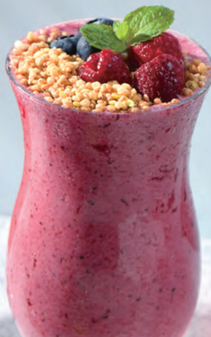
◀ 莓果優格果昔 Mixed Berry Smoothie