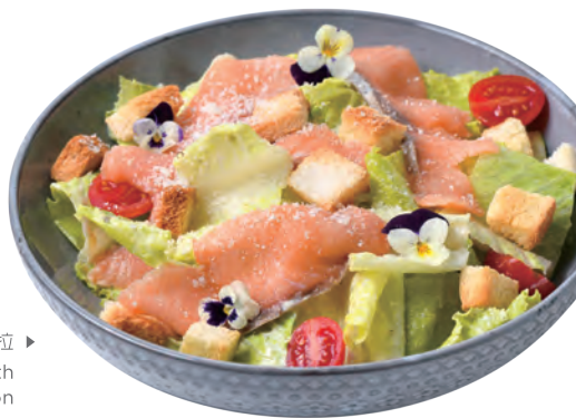
煙燻鮭魚凱薩沙拉 ▶ Caesar Salad with Smoked Salmon