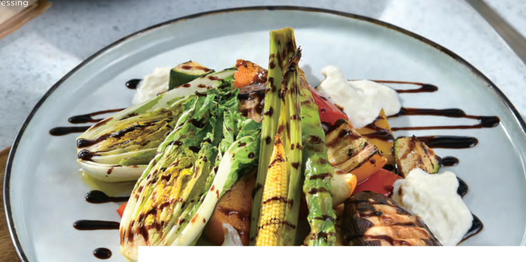
炙烤時蔬沙拉 (蛋奶素) Grilled Veggies with Balsamic Dressing