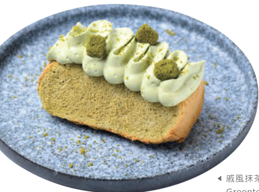
◀ 戚風抹茶香緹 Greentea Chiffon Cake