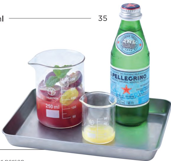
葡萄粒粒氣泡 (DIY組合) ▶ Grape Bubble Drink

The minimum order is a drink / a meal per person